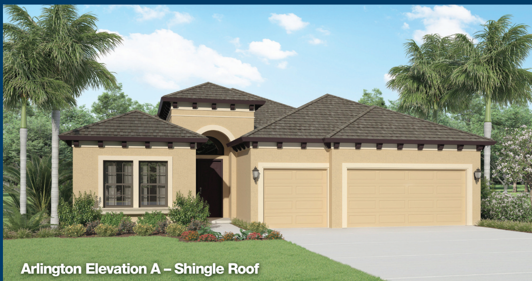
Arlington Elevation A – Shingle Roof

The spacious master suite includes a separate shower and garden tub with large walk in closet.