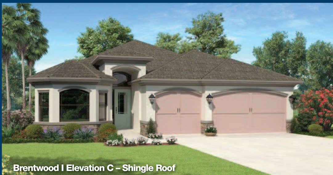
Brentwood I Elevation C – Shingle Roof

This 4/2.5/3 car garage home with covered lanai is perfect!