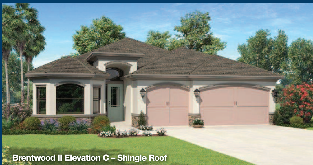
Brentwood II Elevation C – Shingle Roof

This 4/3/3 car garage home with covered Lanai is perfect!