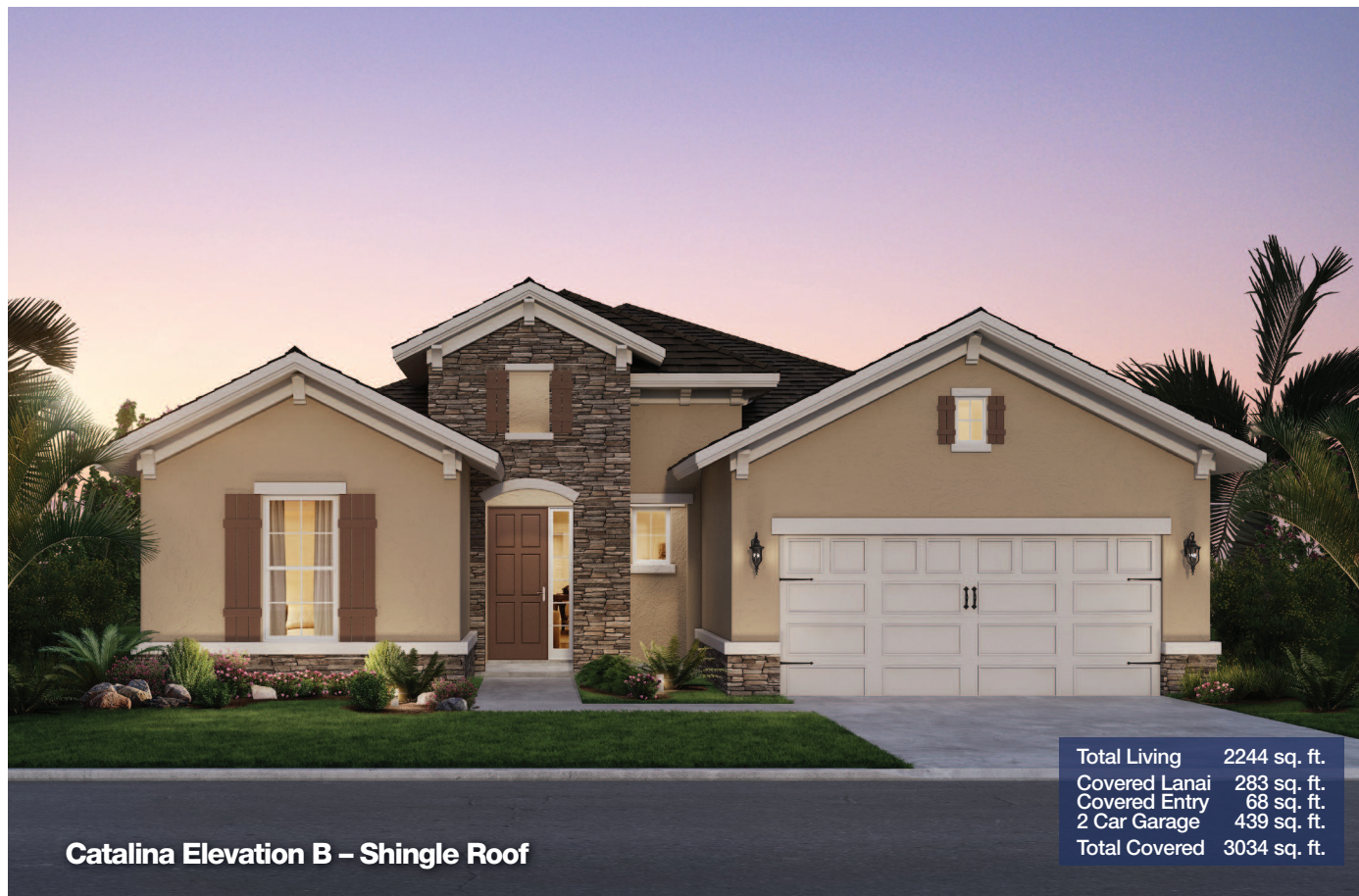
Catalina Elevation B – Shingle Roof