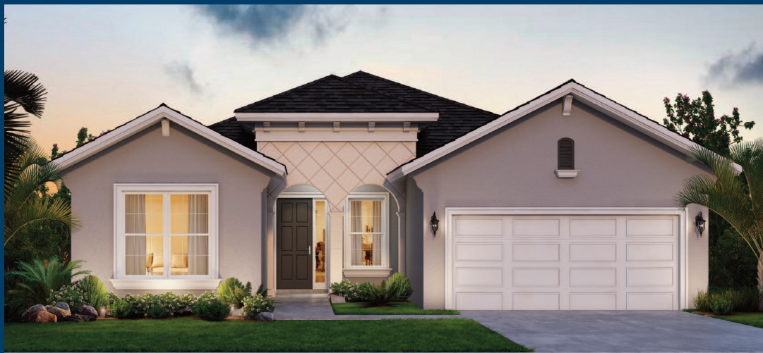
Catalina Elevation A – Shingle Roof

The large walk-in utility room complete with a laundry sink, sits adjacent to a huge storage closet for all of those things you never have room for and a full size powder bath. Extra features include a beautiful entry porch and 2-car garage.