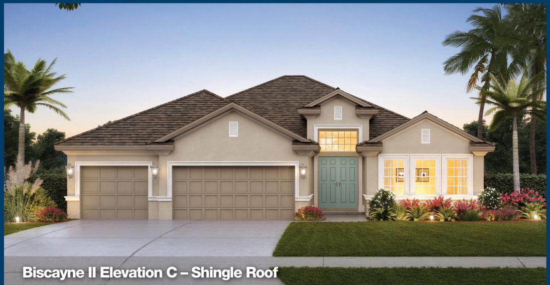
Biscayne II Elevation C – Shingle Roof

A 3-car garage completes this exciting home.