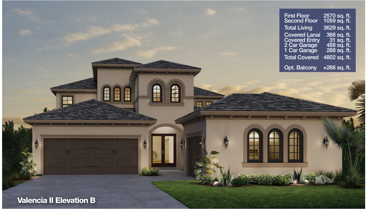
Valencia II Elevation B