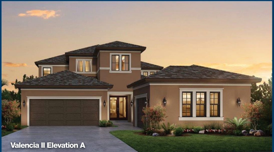
Valencia II Elevation A

We have put great thought into every room in this dream home.