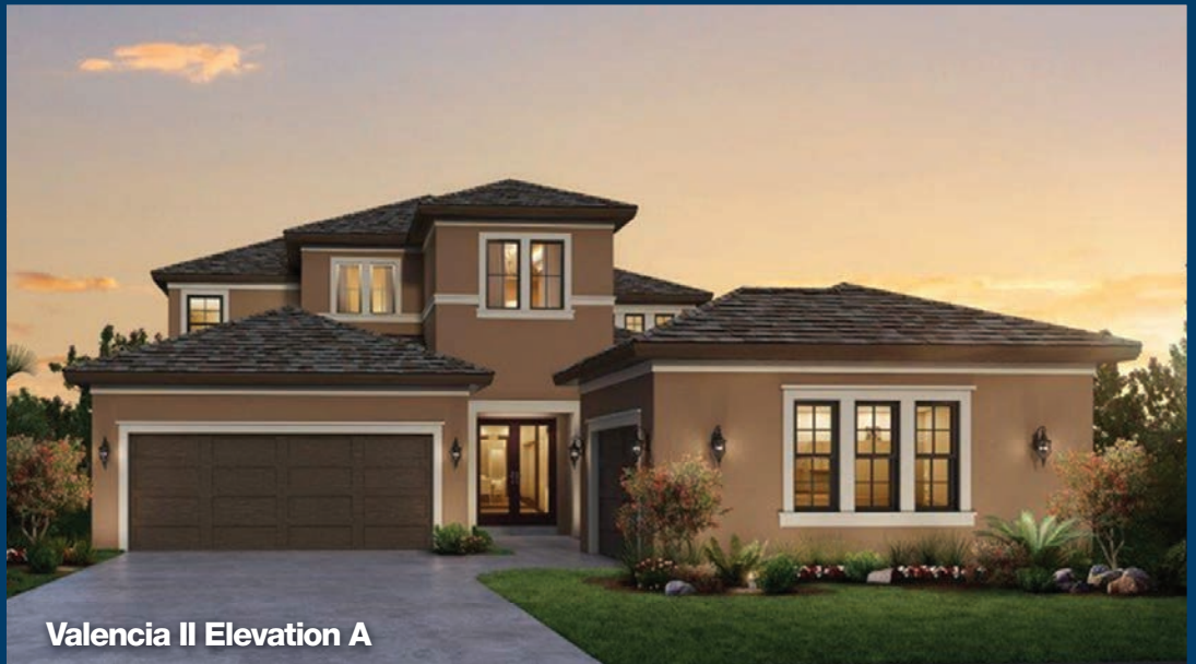
Valencia II Elevation A

We have put great thought into every room in this dream home.